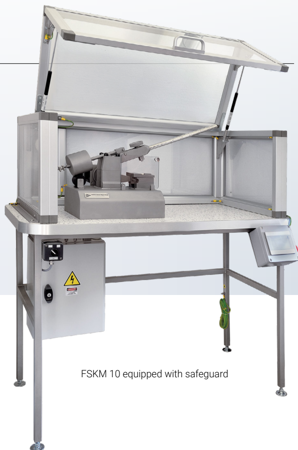
FSKM 10 equipped with safeguard